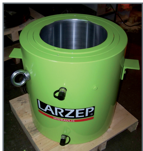
DDR200015 cylinder. 2.000 Tn capacity cylinder to place a load cell for pile testing.