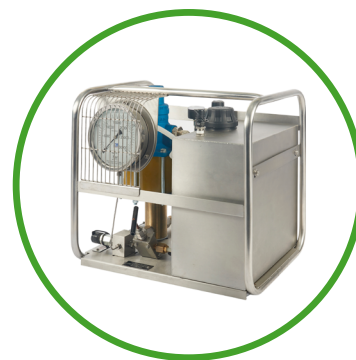
Stainless Steel Subsea Pump