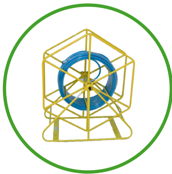
Hose Reel and Downline Hose