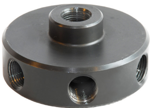
Dağıtıcı Blok Porting Block