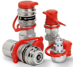
Bağlantı Ekipmanları Connection Equipment