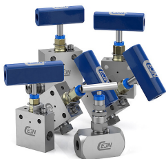
İğne Vana Needle Valves