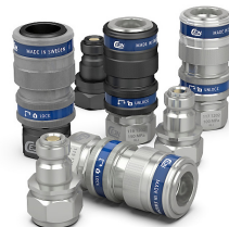
Kaplin Quick Coupling