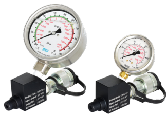
Manometre Adaptörü Gauge Adaptor