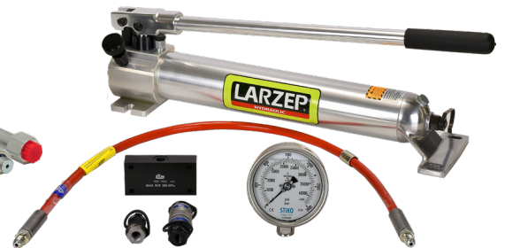
Yüksek Basınç El Pompası Uygulaması High Pressure Hand Pump Application